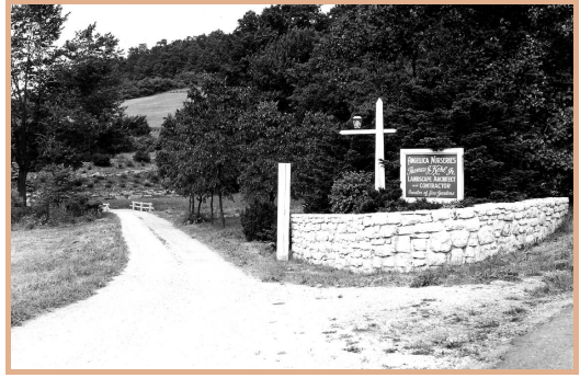
Original Angelica Nurseries Home Farm in Angelica, Pennsylvania

This industry consists of labor intensive processes. As such, we realize that our employees are a vital part of our success. We strive to provide a challenging but rewarding work environment for those who choose a career in the green industry. We are a family-owned and operated business and feel that our family extends to our dedicated employees.