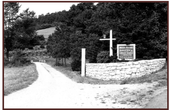
Original Angelica Nurseries Home Farm in Angelica Pennsylvania